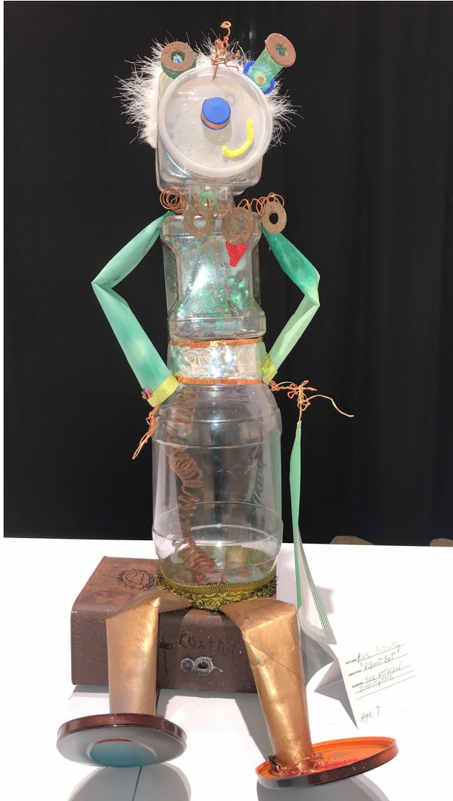
First place Youth Individual.

Next Committee meeting: November 30, 2020 at 12 p.m.